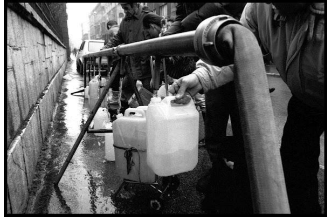
The Bosnian Serbs had cut off water to Sarajevo, so city authorities opened a few taps in various parts of the city, where people came to do their wash, and fetch water to bring home to clean with, flush toilets, and cook with.