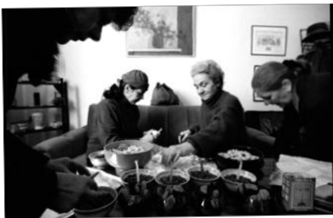
Members of La Bohoreta, the women’s club of La Benevolencija, preparing treats for the children.

Some themes to discuss: What qualities do people of courage and integrity demonstrate? What does it mean to be a leader? What does it mean to be a moral and ethical person? How do these films demonstrate the belief that our common humanity overrides ethnic and religious boundaries? Students could create posters, collages or dramas to demonstrate these ideas.