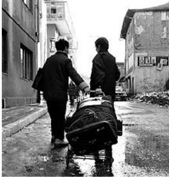
Lots of times you can feel as an exile in a country that you were born in. Azar Nafisi