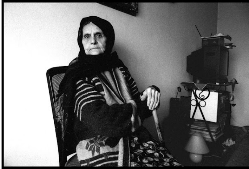
"There still existed a just world outside our own, something and someone still pure and whole... for which it was worth surviving" Primo Levi