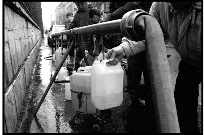
The Bosnian Serbs had cut off water to Sarajevo, so city authorities opened a few taps in various parts of the city, where people came to do their wash, and fetch water to bring home to clean with, flush toilets, and cook with.