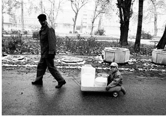
Only oxygen is more essential than water in sustaining the life of all living organisms.