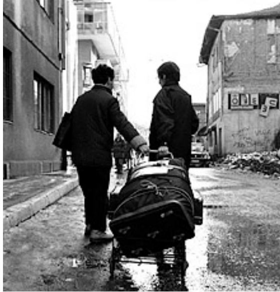
Lots of times you can feel as an exile in a country that you were born in. Azar Nafisi