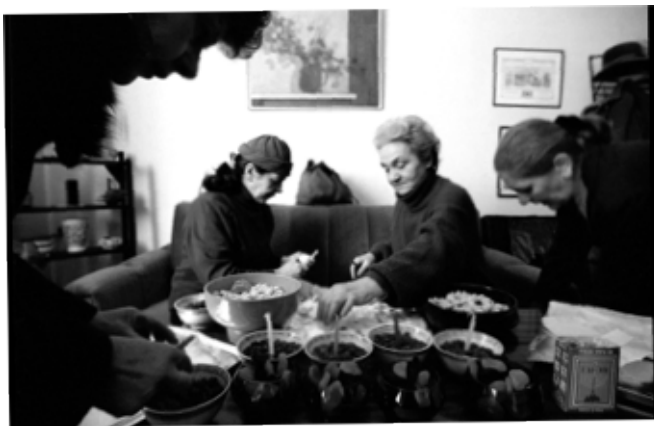
Members of La Bohoreta, the women's club of La Benevolencija, preparing treats for the children.

Some themes to discuss: What qualities do people of courage and integrity demonstrate? What does it mean to be a leader? What does it mean to be a moral and ethical person? How do these films demonstrate the belief that our common humanity overrides ethnic and religious boundaries? Students could create posters, collages or dramas to demonstrate these ideas.