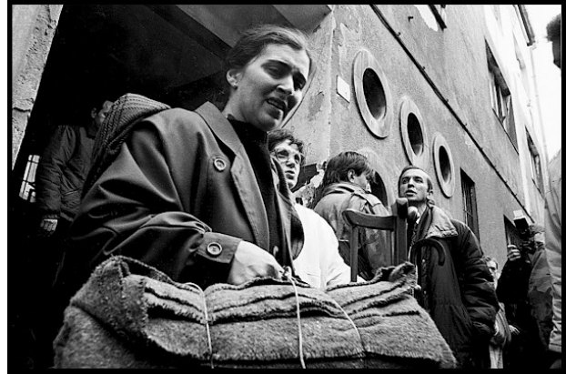
Preparing to leave a city under siege. Between 1992–1995, La Benevolencija organized eleven rescue convoys out of the besieged city. All were underwritten by the American Jewish Joint Distribution Committee