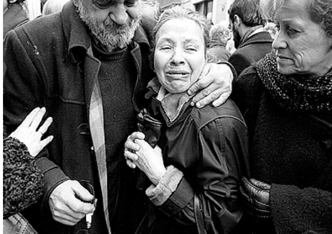
The heart's intention is the measure of all things. Maimonides, Letter to Hasdai HaLevi, 12 th century