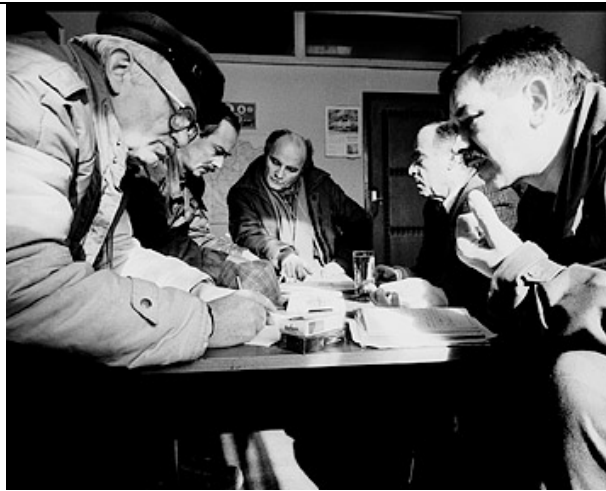
Rabbi Tarfon used to say: It is not up to you to finish the work, but neither are you free to desist from it entirely - Mishnah Avot