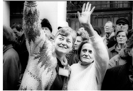
Saying goodbye to loved ones is always hard, but much more so in times of uncertainty and war.