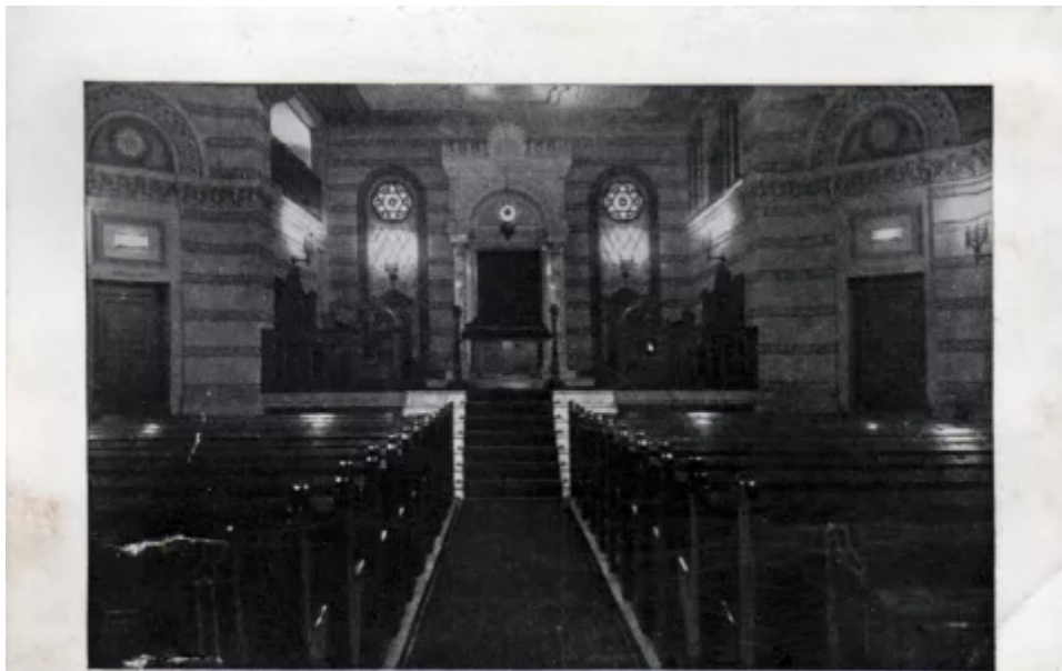
A Pestii Izr. Nőegylet Orsz. Ceányárvaházának temploma.