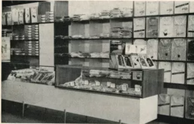
• BELOW: The smart, modern appearance of the "Tom Miller" shop can be gauged by this photo, showing the simply designed counter and the comprehensive shirt display.

the first exclusive Young Man's Shop in this city, incidentally.